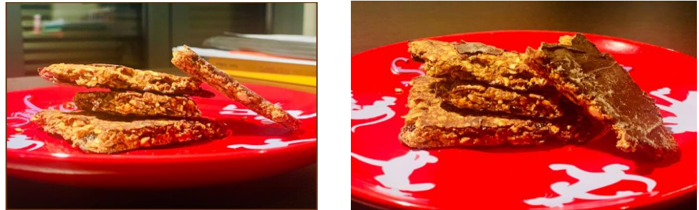
Figure 1. Photograph of baked plant-based snack bars (rice protein and pea protein with Coprinus comatus powder respectively).

snack bar). Plant-based snack bars may be a great “anti-diabetic” group of plant foods, as they contain complex carbohydrates, which the body slowly metabolizes, causing blood glucose levels to rise gradually. Common characteristics of the above bars are their increased fiber content and, as a consequence, their low glycemic index [55].